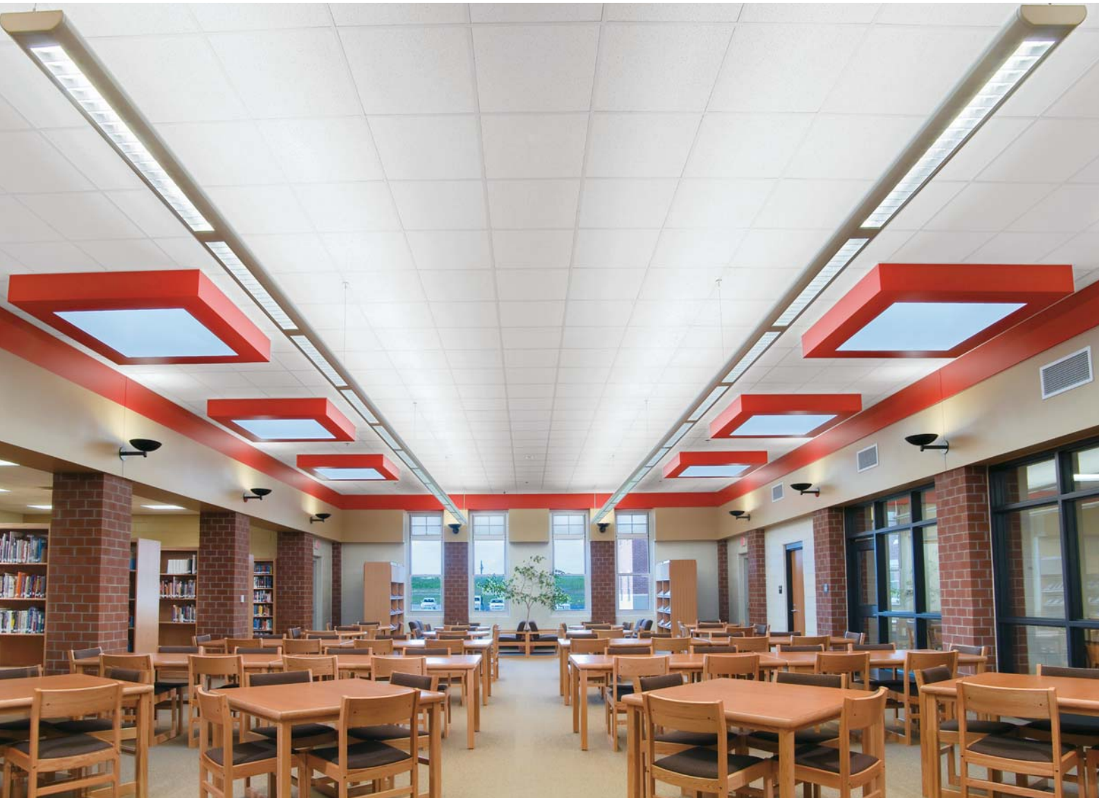
FINE FISSURED Square Edge with PeakForm™ Prelude™ XL 24mm Exposed Tee grid